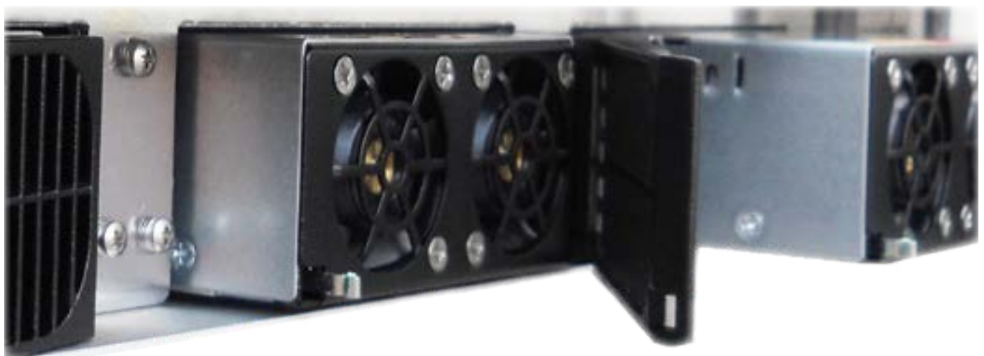
Detail of hot swappable power supply units on PFG NEXT

Furthermore in case the optional chosen configuration is (/DPS2), i.e. with dual high power power supply, the power loss will be less than 10%, this means that the transmitter will keep on working almost at its full power.