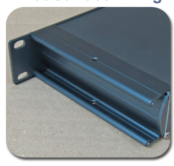
Side Wings For Flat Surface Fixing

A Signature unit has side wings with mounting holes at the top and bottom, allowing flush fixing from above OR underneath.