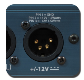
12V DC Power Connection

All Signature units (except PS1) have a 4 pin XLR ±12V DC socket for connection to the PS1 Power Station. This can act as the primary or backup power source.